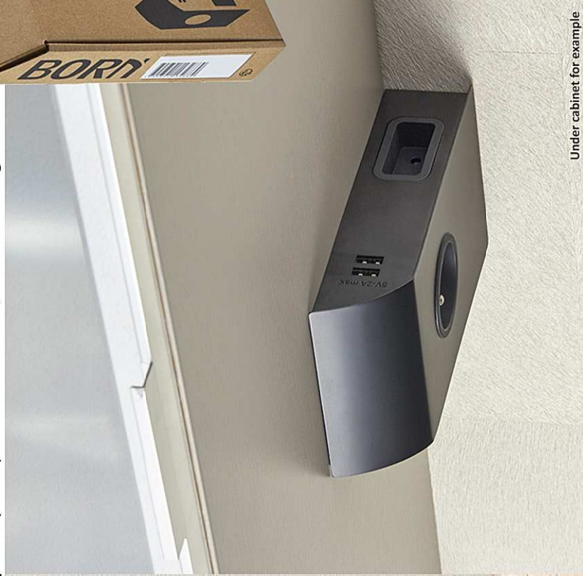
Under cabinet for example