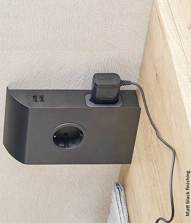
Matt black finishing

« Perfect to wire small electrical appliances »