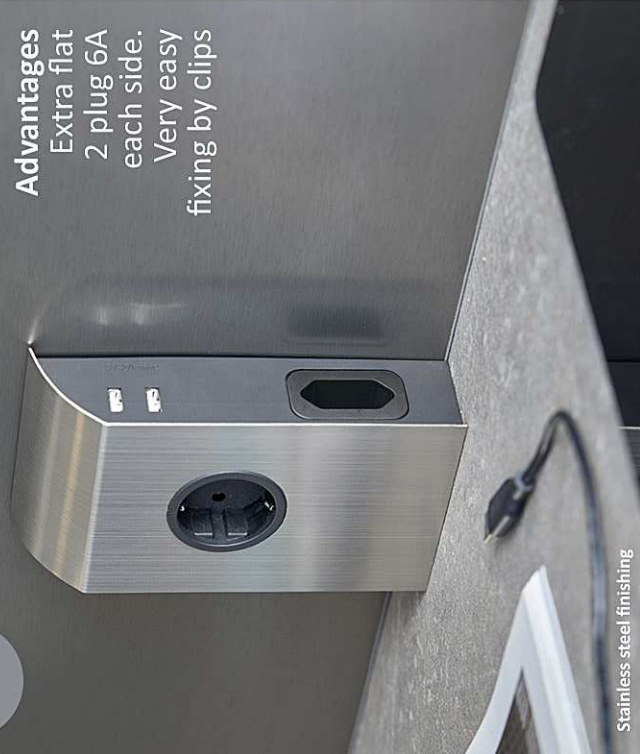
Stainless steel finishing

« Perfect to wire small electrical appliances »