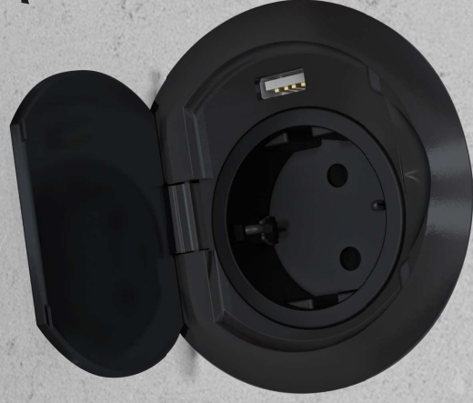
Matte black finishing