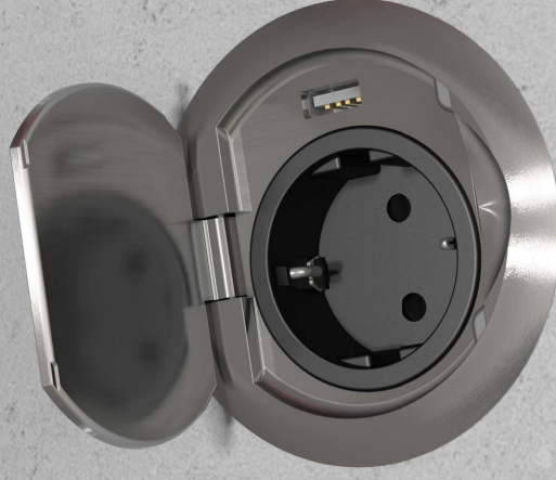
Brushed chrome finishing