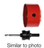
Similar to photo